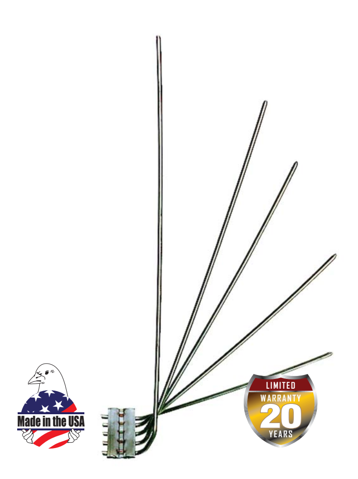
Image shows the 5 wires per inch half row wire coverage. (Shown 20% larger than actual size)